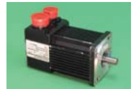
Allen Bradley Servomotor 1326 Series