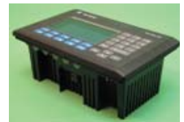
Allen Bradley PanelView