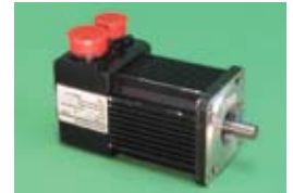
Allen Bradley Servomotor 1326 Series