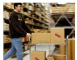
Turnaround in days.