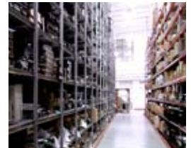
Vast inventory of parts.