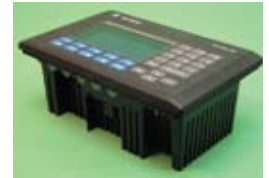
Allen Bradley PanelView