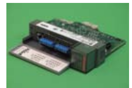
Allen Bradley SLC500 Module